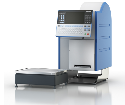
GLP-Imaxx - table-top version with scale

The GLP-Imaxx can be used as a label printer for product labeling in the food processing industry as well as in manufacturing trade and logistics. It is perfectly suitable for dispatch and stock labels. In combination with the Bizerba weighing technology it is the perfect starter kit for manual price labeling. The GLP-Imaxx can process label rolls with a diameter of up to 300 mm. Thus retrofitting time is reduced - especially with large labels. The printers are network compatible and can also be controlled directly via the Internet. Settings and maintenance of the printer unit can be made without need of any tools - reducing costs and increasing print quality. The new PC-based hardware provides more memory space and fast label data processing. By means of an USB port it is easy to run data backups and to buffer statistical data. The operating terminal GT-7C with color display can be operated ergonomically and thus reduces operating errors. Moreover, an operating terminal with color touchscreen is optionally available.